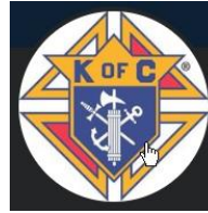
Knights of Columbus, Rainy Lake Council #2766