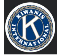
Kiwanis Club of Fort Frances