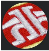
Tompkins Home Hardware