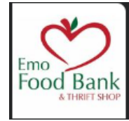
Emo Food Bank & Thrift Shop