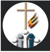
Fort Frances Church of the Holy Spirit