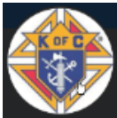
Knights of Columbus Rainy Lake Council #2766