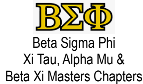
Beta Sigma Phi Xi Tau, Alpha Mu & Beta Xi Masters Chapters